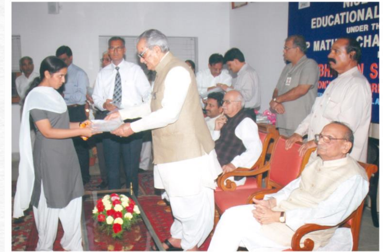
Scholarship Award Ceremony chaired by the then Hon'ble Vice-President of India Shri Bhairon Singh Shekhawat Ji.