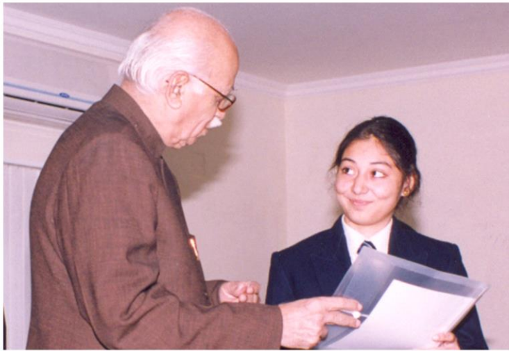
Scholarship Award Ceremony Chaired by the then Hon'ble Deputy Prime Minister Shri L.K. Advani ji.