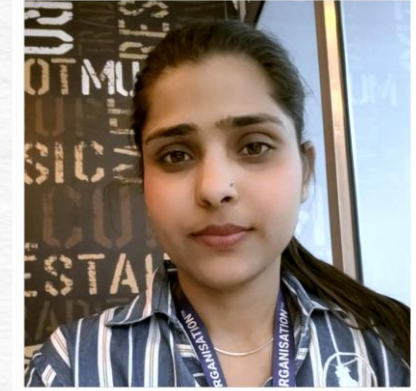
Vini Saini SEO, Pearl organization in Dehradun