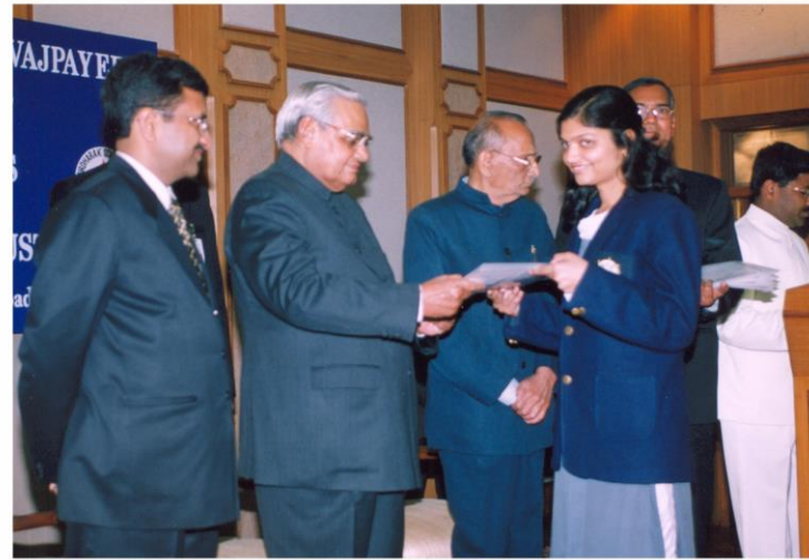
Scholarship Award Ceremony chaired by the then Hon'ble Prime Minister of India Shri Atal Bihari Vajpayee Ji.